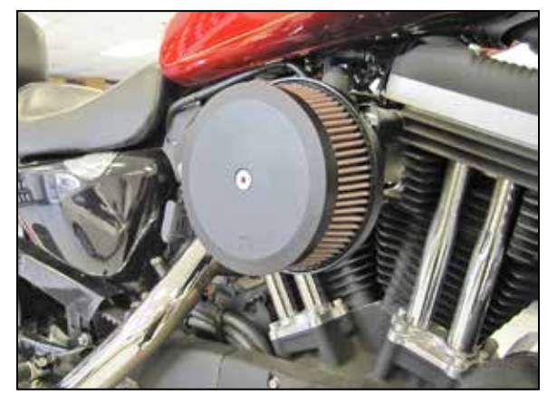
11. Install the filter cover and secure with the provided bolt.

10. Install the K&N<sup>®</sup> air filter onto the back plate and secure with the provided hardware. NOTE: Be sure to place one drop of the provided thread locker onto the threads of the bolts.