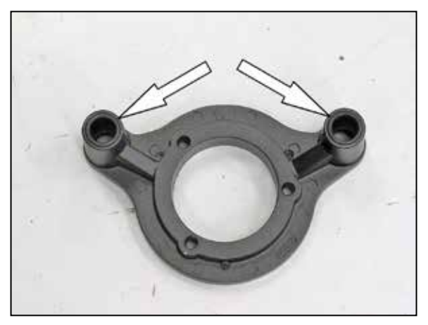
6. Install two of the provided O-Rings into the K&N<sup>®</sup> throttle body bracket as shown.

5. Remove the bolt securing the throttle body bracket and then remove the throttle body bracket from the vehicle.